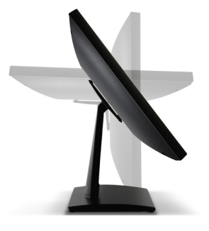
90-degrees of Adjustment