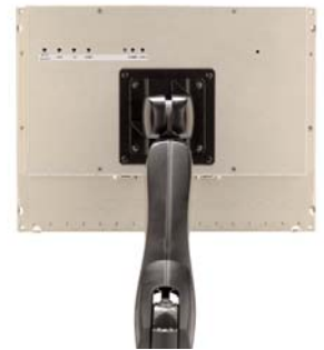
Rear view with VESA-mount arm