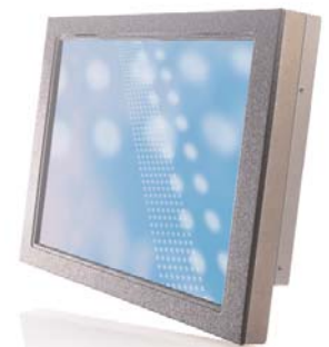
ChassisTouch Monitor with optional flush bezel